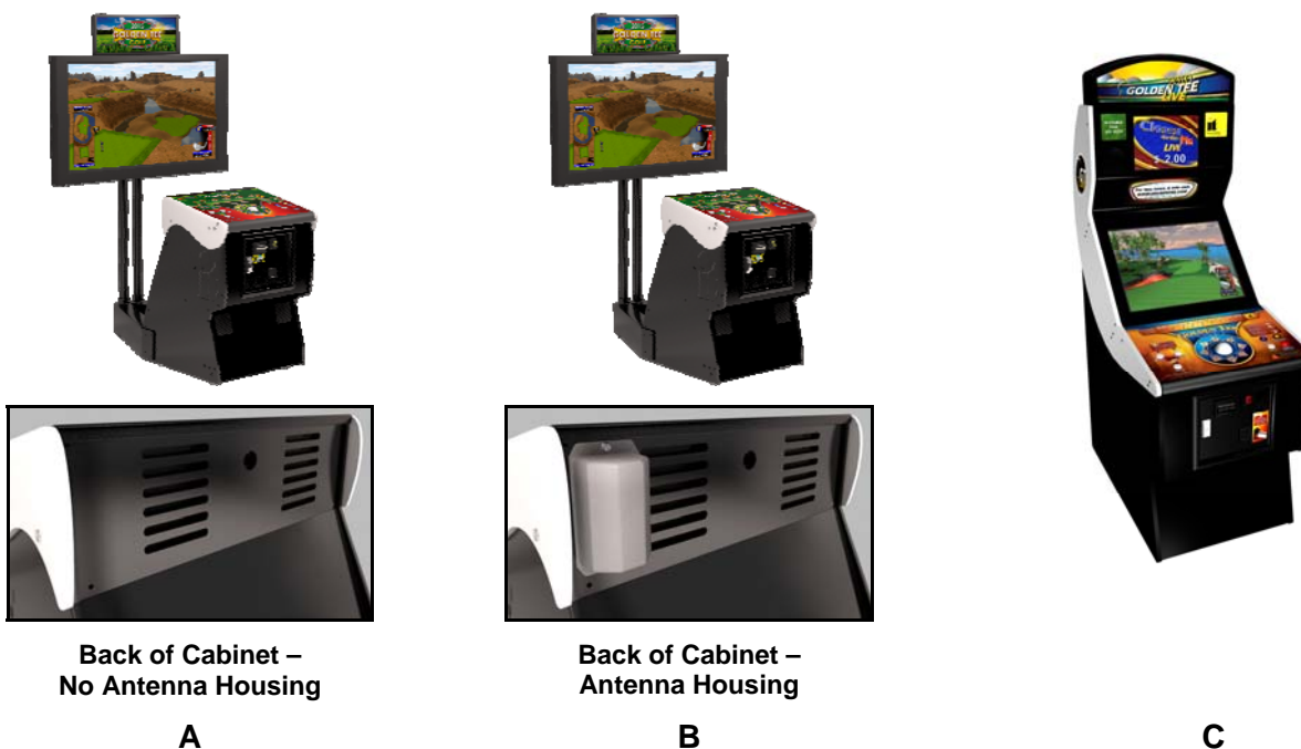
Back of Cabinet – No Antenna Housing

Determine the style for your cabinet and follow the instructions for A or B (rear mount), or C (side mount).