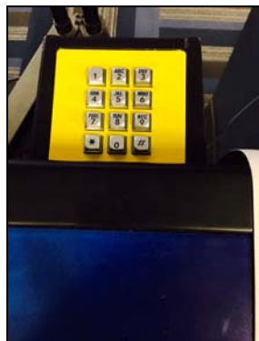
A & B